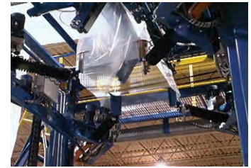
Spreader-belt film delivery option