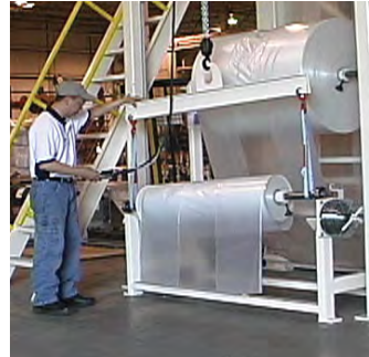
Hoist and dual film roll option