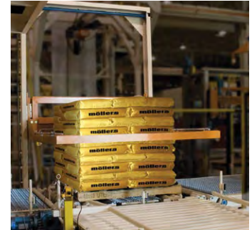
Automatic load profile scanner