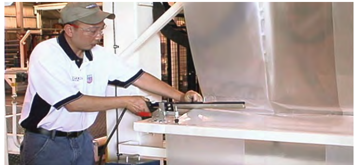
Splicing table with clamps folds down allowing fast and easy film roll splicing